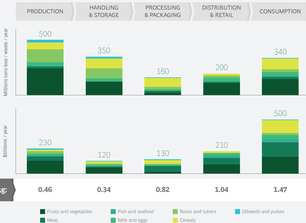
EXHIBIT 1 | Food Loss and Waste Occur Across the Value Chain

For each driver, we estimated the annual reduction in loss and waste that would be possible if all stakeholders—such as governments, NGOs, farmers, and companies—took action. (See Exhibit 2.) The estimates are based on currently available